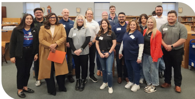
Texas bank volunteers are ready for a full day of volunteering with Junior Achievement of Dallas to empower 3rd-5th grade students at W.T. Hanes Elementary.

On February 14, 2025, TexasBank volunteers brought financial education to life for 334 3rd to 5th graders at W.T. Hanes Elementary School. Through Junior Achievement's interactive programs, our team guided 16 classes in exploring fundamental business and economic principles—connecting classroom learning to real-world careers. By sharing their time, expertise, and enthusiasm, our volunteers empowered students with valuable skills for their futures.