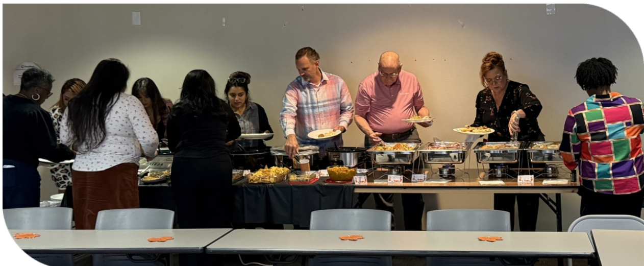
Our Fort Worth team lines up for the annual Thanksgiving lunch.