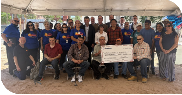
celebrated the groundbreaking ceremony for Casa de los Abuelitos on May 22, 2024.